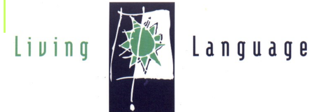
16 JUIN 2010